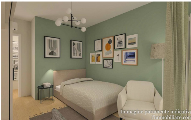
Immagine puramente indicativa l'immobiliare.com