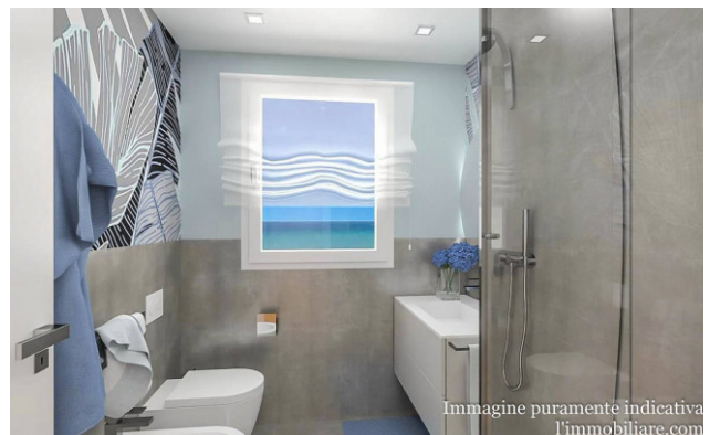
Immagine puramente indicativa l'immobiliare.com

L'Immobiliare.com | Verona Ponte Crencano