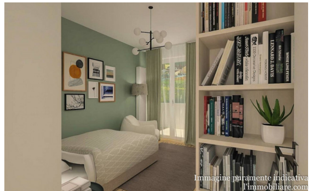
Immagine puramente indicativa l'immobiliare.com