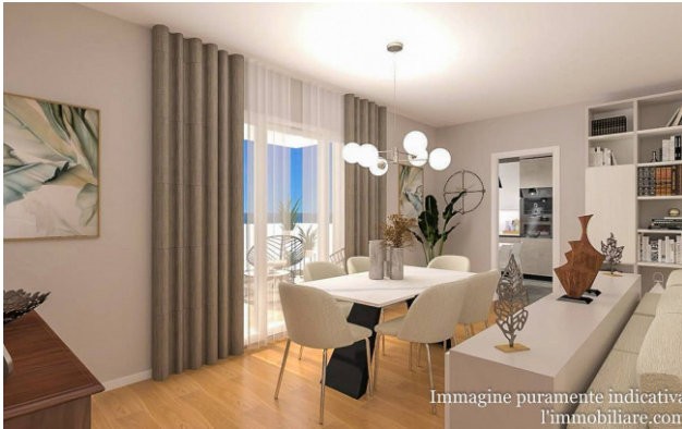
Immagine puramente indicativa l'immobiliare.com