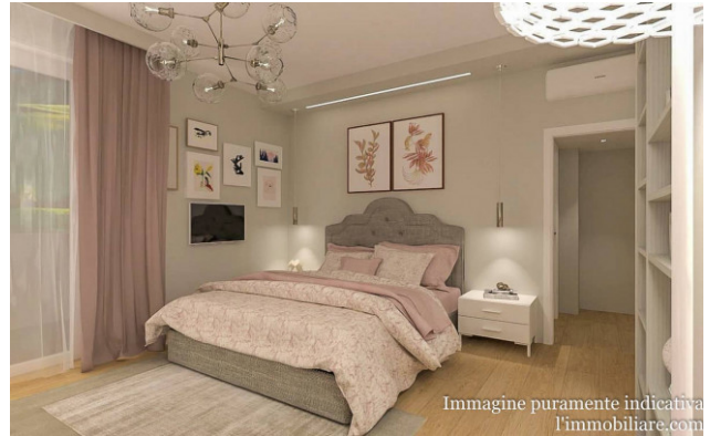
Immagine puramente indicativa l'immobiliare.com