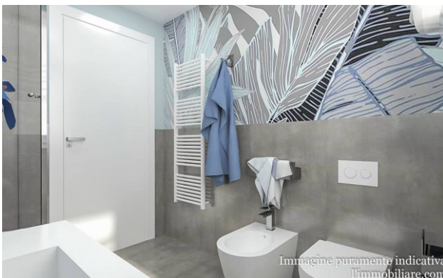
Immagine puramente indicativa l'immobiliare.com