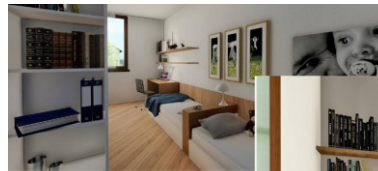
SECONDA CAMERA e BAGNO