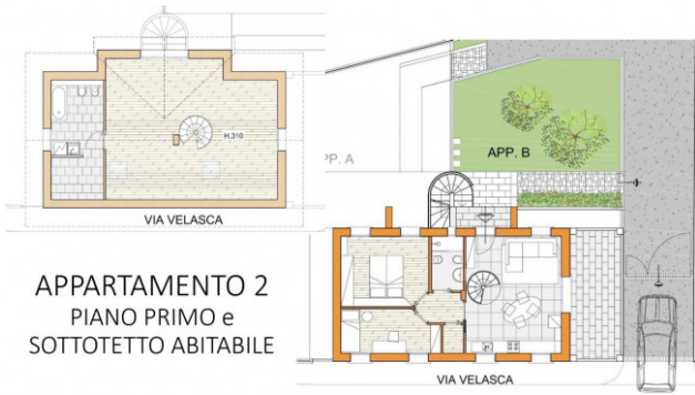
APPARTAMENTO 2 PIANO PRIMO e SOTTOTETTO ABITABILE