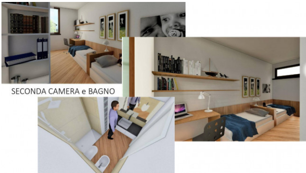
SECONDA CAMERA e BAGNO