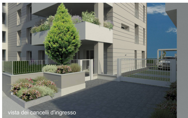
vista dei cancelli d'ingresso