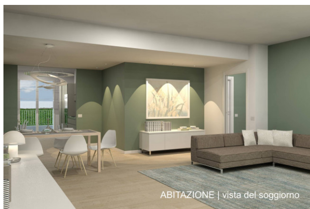
ABITAZIONE | vista del soggiorno