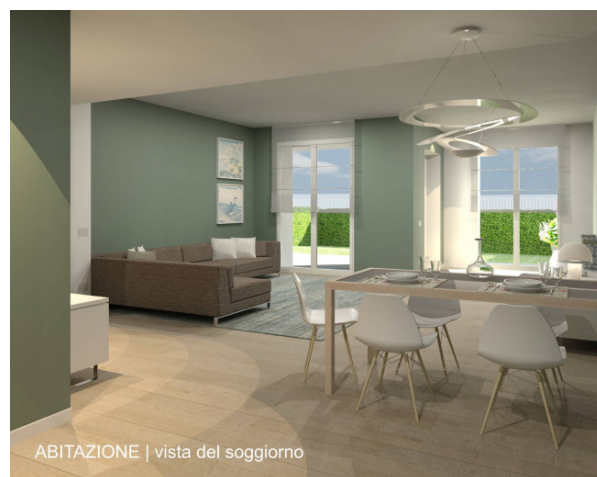
ABITAZIONE | vista del soggiorno