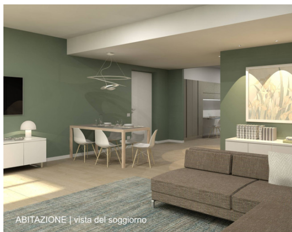
ABITAZIONE | vista del soggiorno