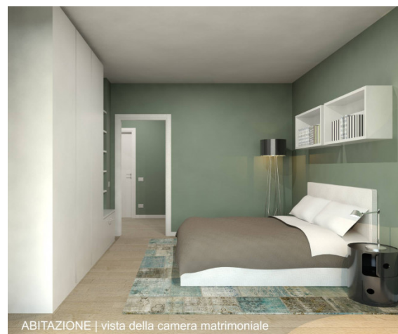
ABITAZIONE | vista della camera matrimoniale