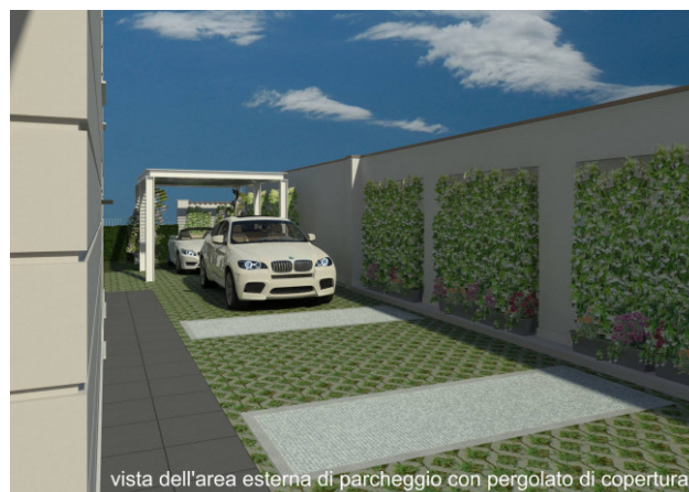
vista dell'area esterna di parcheggio con pergolato di copertura