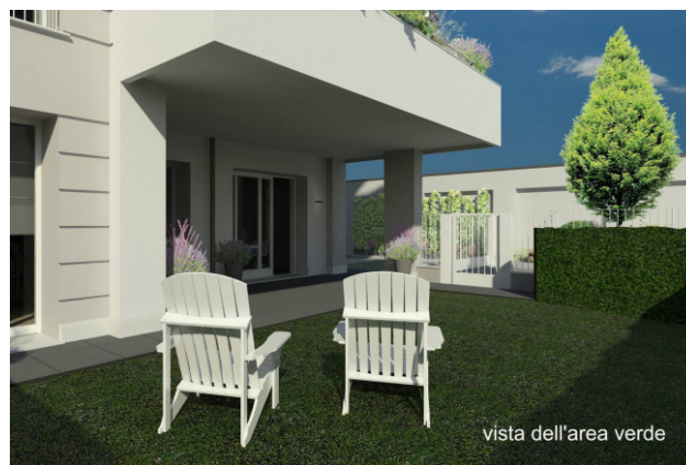
vista dell'area verde