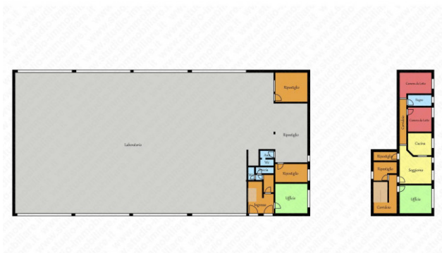
Pianta piano terra