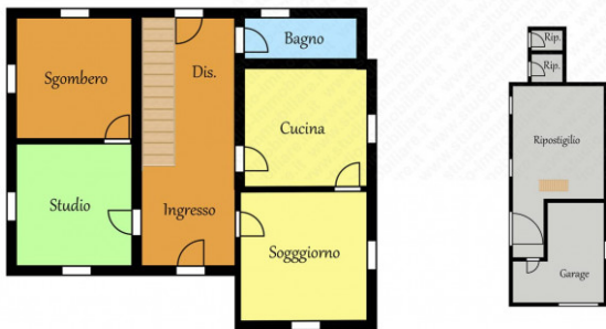
Pianta piano terra