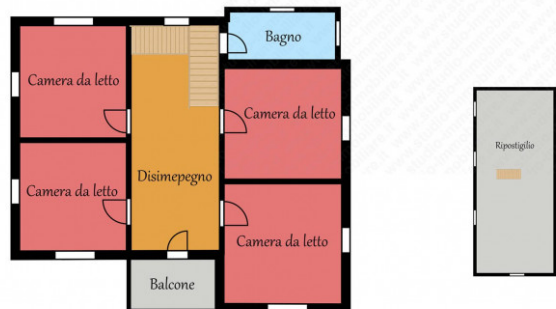
Pianta piano primo

Partner of L'Immobiliare.com | Bergantino