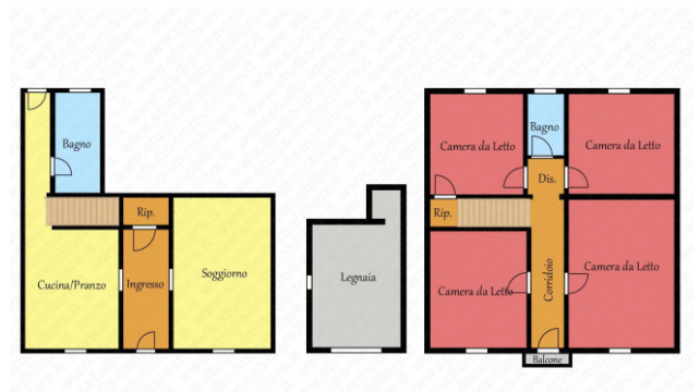
Pianta piano terra